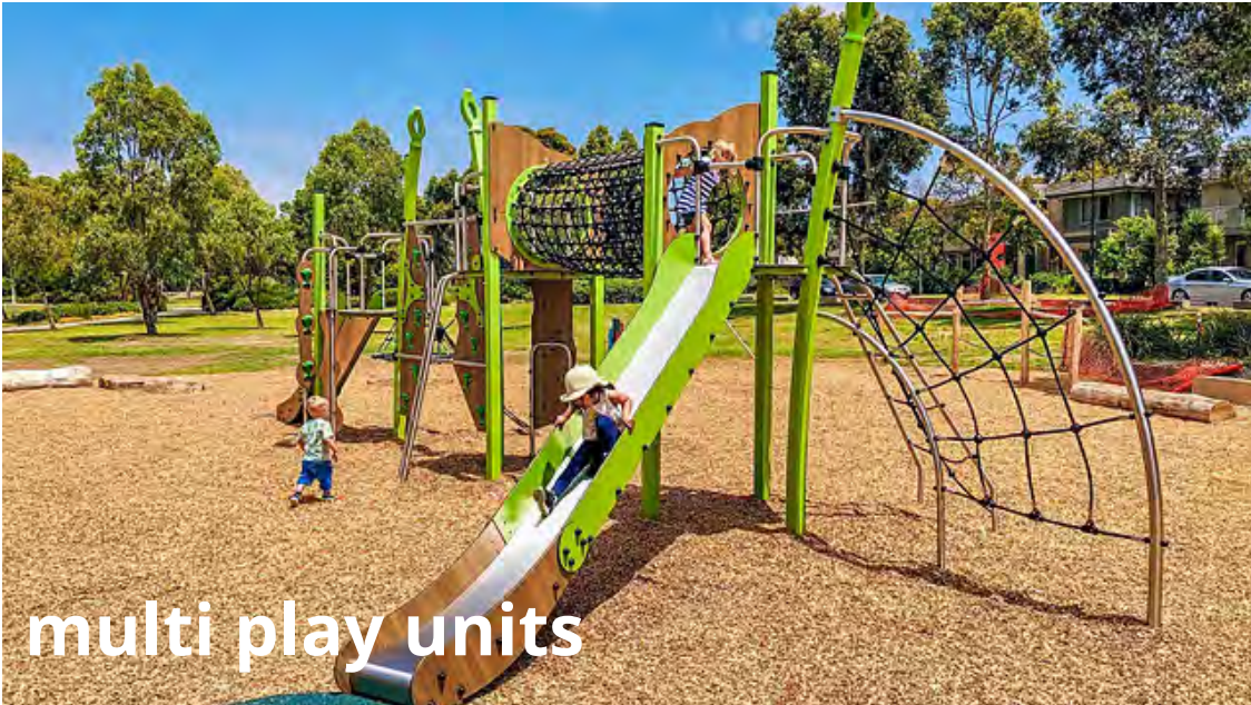
multi play units