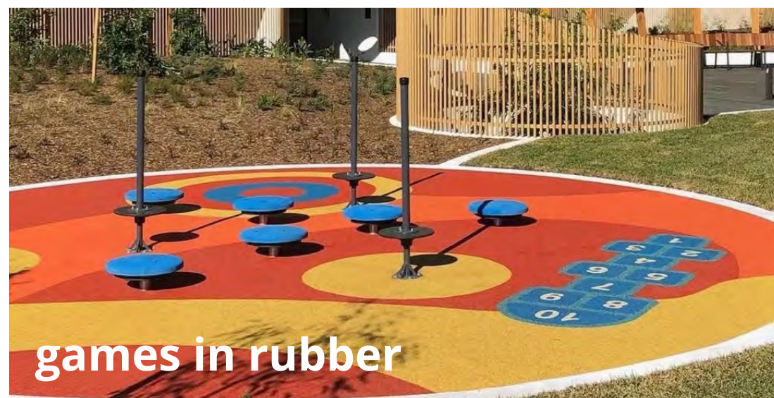
games in rubber